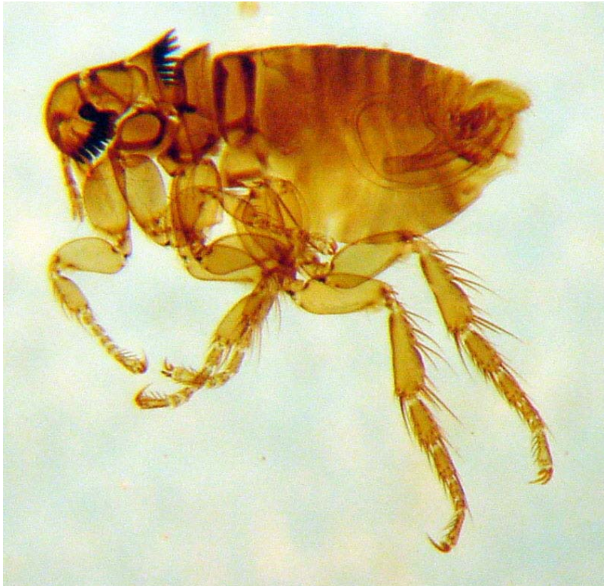
Spilopsyllus cuniculi , male: entire (A); genitalia (B).