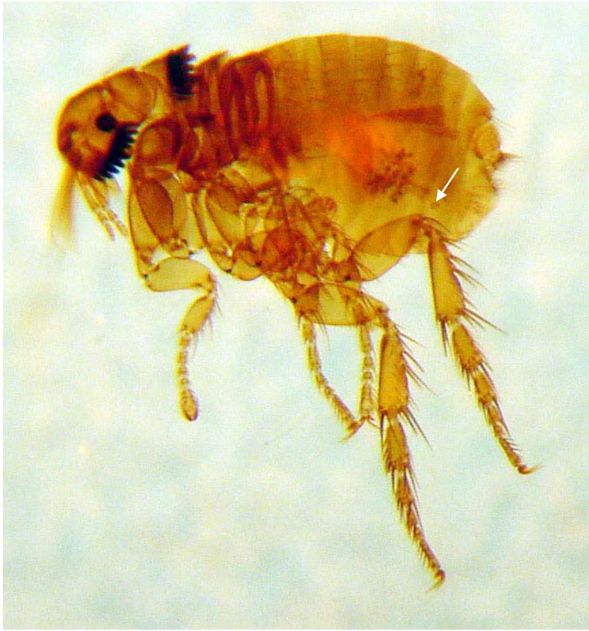
Spilopsyllus cuniculi , female: entire (A); spermatheca (B); shown as arrow in A.